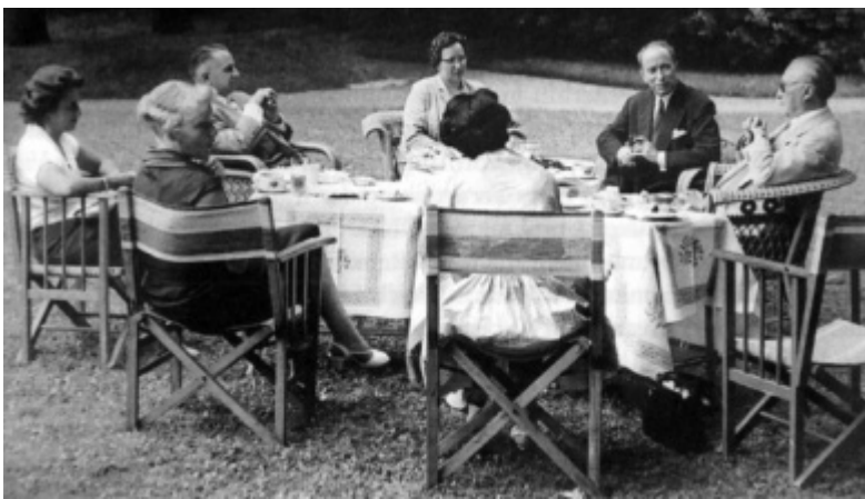
Konrad Adenauer meets with Antoine Pinay and Jean Violet at the earliest known meeting of Le Cercle, on 18th August 1958

Le Cercle is a European deep state milieu dating back to 1952 . As one of (very) few groups capable of carrying out covert regime change operations in a wide range of Western European nation states, it was a key component of the European-based alliance of deep state groups that gradually coalesced to become a covert alliance with an international large reach. [4] Those put in power include such influential politicians as Margaret Thatcher [5] . Other activities included arms dealing and fraud .