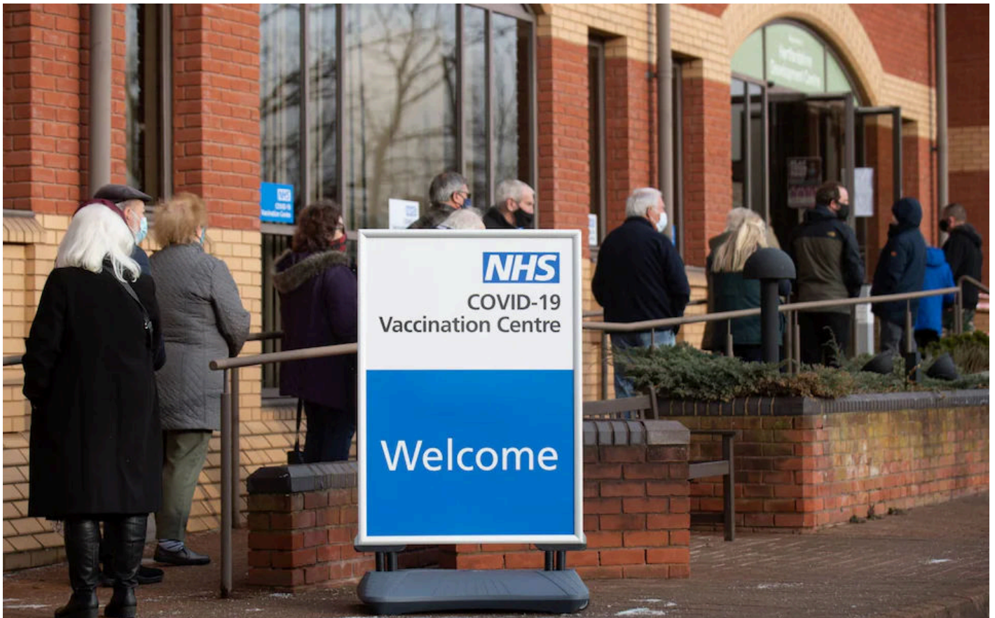
Tens of millions of people were vaccinated during the pandemic

They added: “During the pandemic, it was emphasised by politicians and the media on a daily basis that every Covid-19 death mattered and every life deserved protection through containment measures and Covid-19 vaccines. In the aftermath of the pandemic, the same moral should apply.”