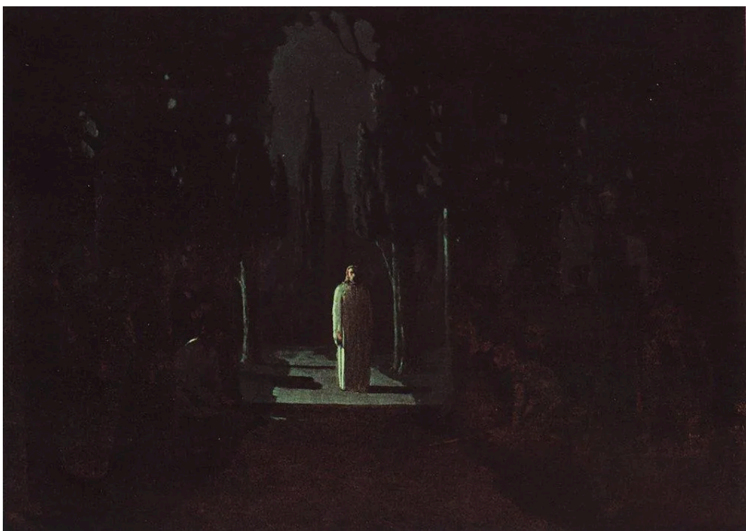
Christ in the garden of Gethsemane. Arkhyp Kuindzhi (1901). Ukraine.

Still, his sorrow does not end there. Like us, Christ suffered in body, mind, and spirit. And his spiritual pain would perhaps swallow even his physical and mental anguish.