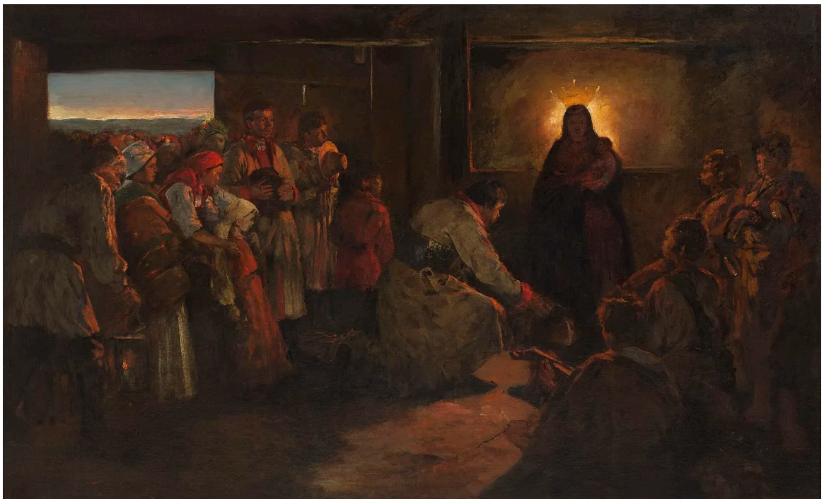
Adoration of the Mother of God. Włodzimierz Tetmajer (1895). Polska.

EDAU IS DEMONETISING - PLEASE DO NOT BUY A PAID SUBSCRIPTION will be off Substack at the end of December.