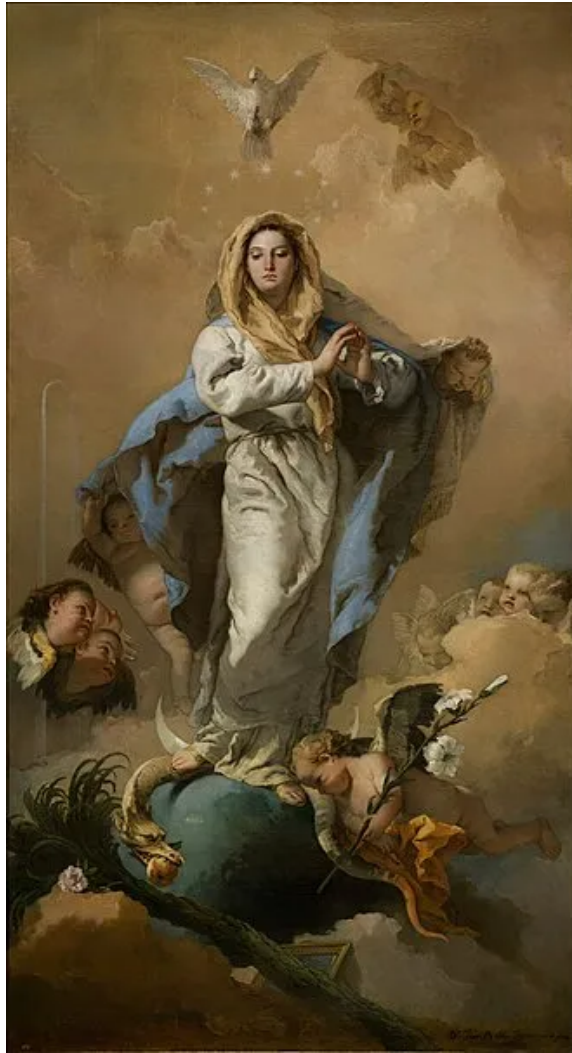
The Immaculate Conception. Giovanni Battista Tiepolo (1767).